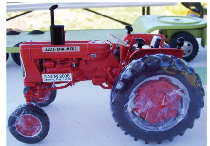
Allis Chalmers D-15 Hi-Crop Tractor

All proceeds go to support The Farm Museum.